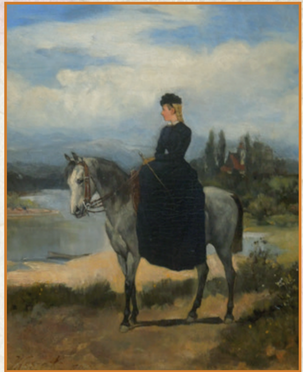
Lady rider, painted by Juliusz Kossak in 1878, source: Wikimedia