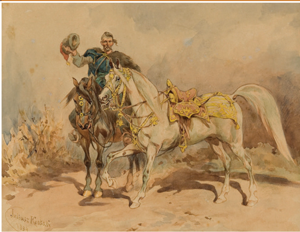
Cossack with an Arabian horse, painted by Juliusz Kossak in 1884