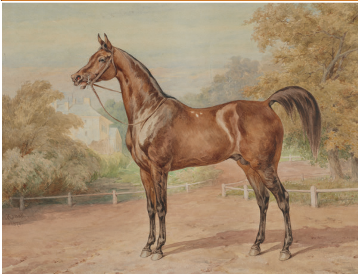
Racing horse Carogród from the herd of Sanguszko, painted by Juliusz Kossak in 1871

the caliphates and kingdoms, Arabia itself remained on the margins of the great Arab-Muslim empire. The Bedouins, on the other hand, lived their old way of life, keeping their traditions and customs. It was also then (around the 13th century) that the flow of foreign blood to the Arabian horse breed probably ended. In the following centuries, Bedouins and their horses only migrated across the deserts of Arabia: Central Arabia, Syria, Mesopotamia and Palestine. These movements were conducive to maintaining a uniform breed of Arabian horses. In the specific environment of the Arabian Peninsula, the characteristics that distinguish this breed were formed: bravery, beauty, dry tissue, speed and the typical gentleness of character. Europeans traveling in Arabia between the thirteenth and nineteenth centuries agree that the best Arabian horses can be found among members of the Anaza tribe, once nomadic in the interior of Arabia, who left the Nejd deserts and settled in the desert areas of Syria and northern Arabia. Among the Bedouins, the descendants of the former nomadic horse breeders, various ancient traditions concerning the genealogy of Arabian horses are still alive today. They are mentioned by