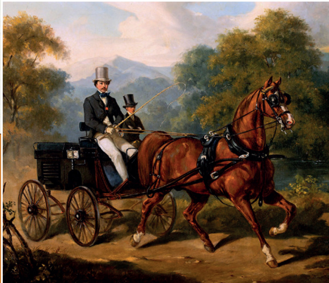
A carriage ride, painted by Juliusz Kossak in 1852, source: Polswissart.pl