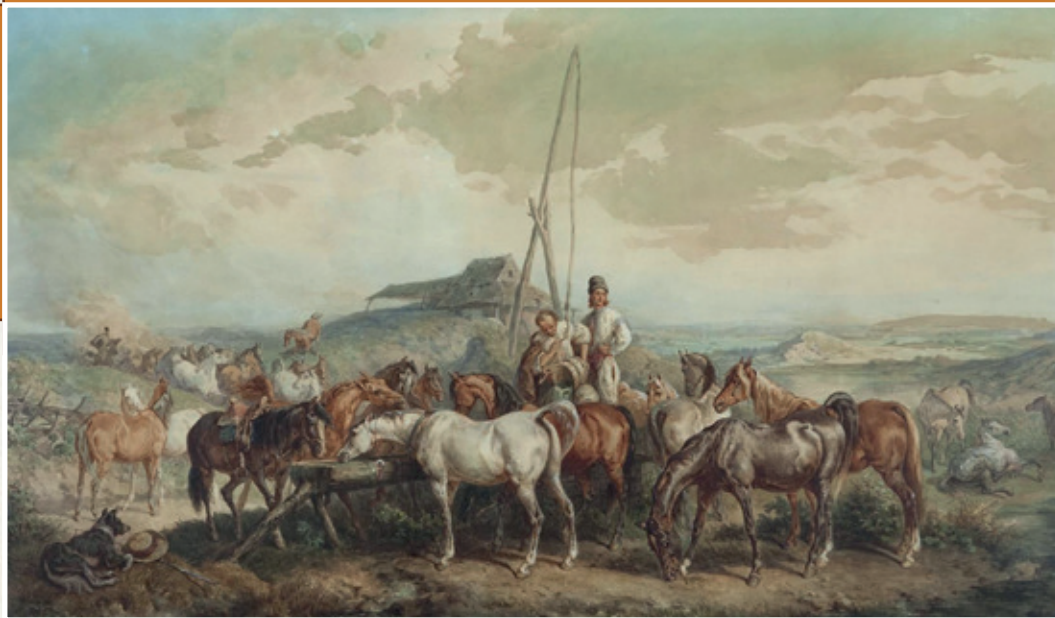
Arabian herd at watering hole, painted by Juliusz Kossak in 1857