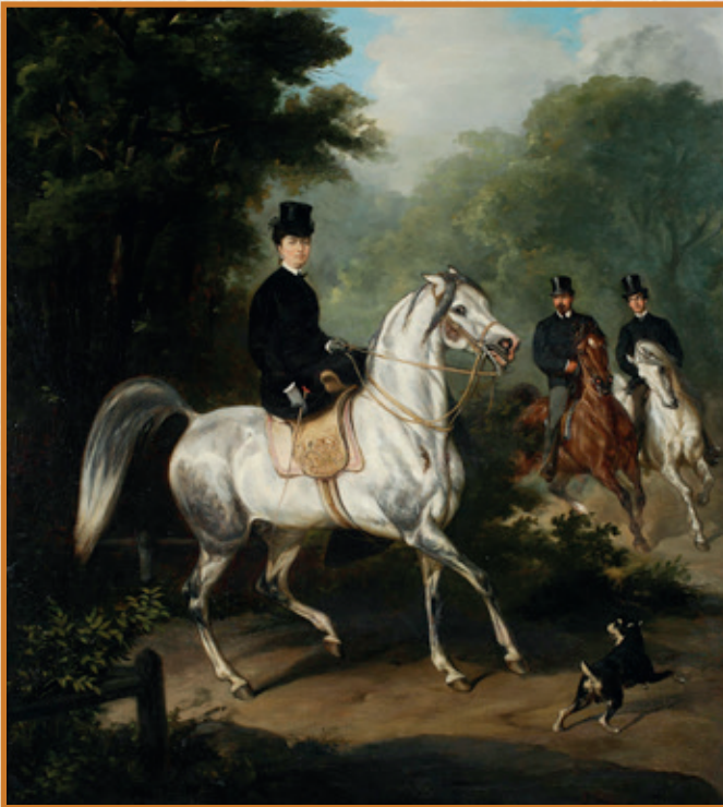
Amazon lady, painted by Juliusz Kossak in 1868