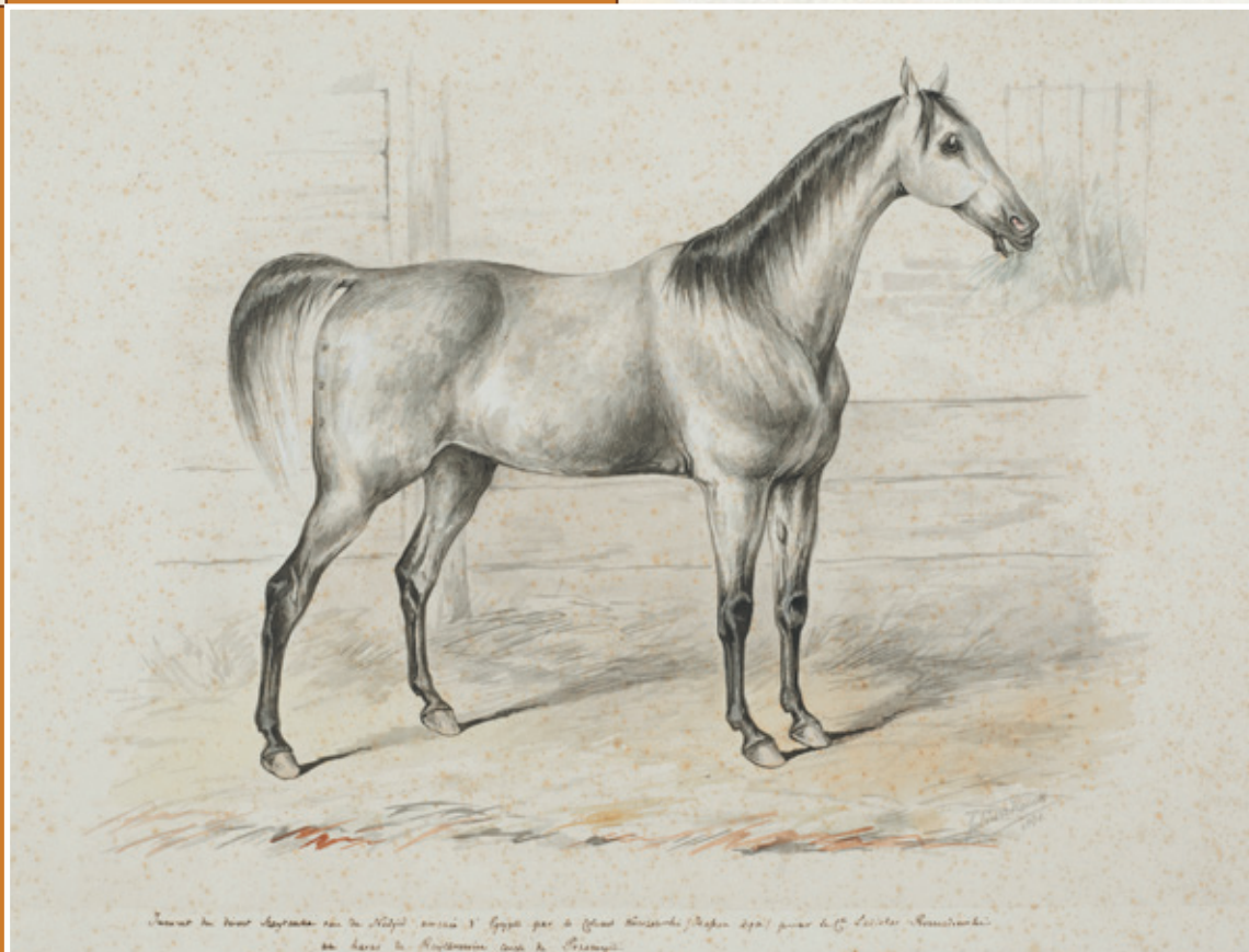
The mare Szaytanka, painted by Juliusz Kossak in 1844, source: Regional Museum in Tarnów, Poland

breeds entering Arabia from the east, west and south. During the great conquests of the 7th-8th centuries, the Arabs, moving westwards, encountered Berber horses in Africa, and then the aforementioned breeds were mixed — that is, horses from southern Arabia with horses from northern Africa. It should be assumed that such horses came to Spain and southern Europe. After the conquests ended, with the rise of