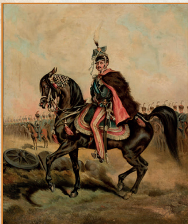
Prince Józef Poniatowski on the stallion Szumka from the stud of Prince Sanguszko in Poland, painted by Juliusz Kossak in 1879, source: National Museum of Warsaw

In the interwar period, the leading role in domestic breeding was played by horses derived from three mares brought from Arabia in 1845 by Juliusz Dzieduszycki, i.e. Gazella d.b., Mlecha d.b. and Sahara d.b. The Dzieduszycki stud in Jarcowce, much older, dating back to 1791, adopted the Arabian-only direction in 1845. It was then that Juliusz Dzieduszycki brought seven desert stallions and four mares from Arabia, including the three mentioned above - as it turned out - founders of dam lines that are so important today. The stud in Jarcowce (then continued in Jezupol) had operated for 73 years, that is until 1918. The well-reproduced Jarcowce dam lines are an extremely valuable breeding legacy of the Dzieduszycki family. Jarcowce also started two sire lines, of which one has survived to this day: Krzyżyk d.b. (born in 1869, imp. 1876 Jarcowce).