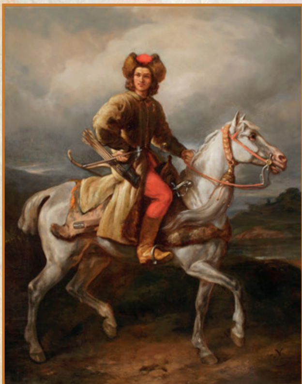
Lisowczyk, painted by Juliusz Kossak in 1860-1965

for horses to Arabia. From that moment, until 1945, the Sanguszko breeding was carried out invariably in the Arabian direction, i.e. for 141 years (also in Antoniny and Gumniska near Tarnów). The number of their breeding was significant, which allowed for the selection of the best horses and the production and then preserving of entire families. 12 dam lines were established there: “the oldest of the Sławuta families was descended from a mare without a name, born around 1790, which survived until the 1930s, reaching 10 generations, but no longer exists.”* From among the Sławuta families, there are currently four in Polish breeding: Szweykowska b. c. 1800, Milordka b. c. 1810, Wołoszka b. c. 1810, Ukrainka b. c. 1815. Equally important is the heritage of the Sławuta breeding in establishing sire lines. Until now, two lines have survived, which have issued many generations and are continued in Poland and successfully in the world. They are lines descending from the stallions: Ilderim or.ar. imp. 1900 to Sławuta, Ibrahim d.b. imp. 1907 to Antoniny.