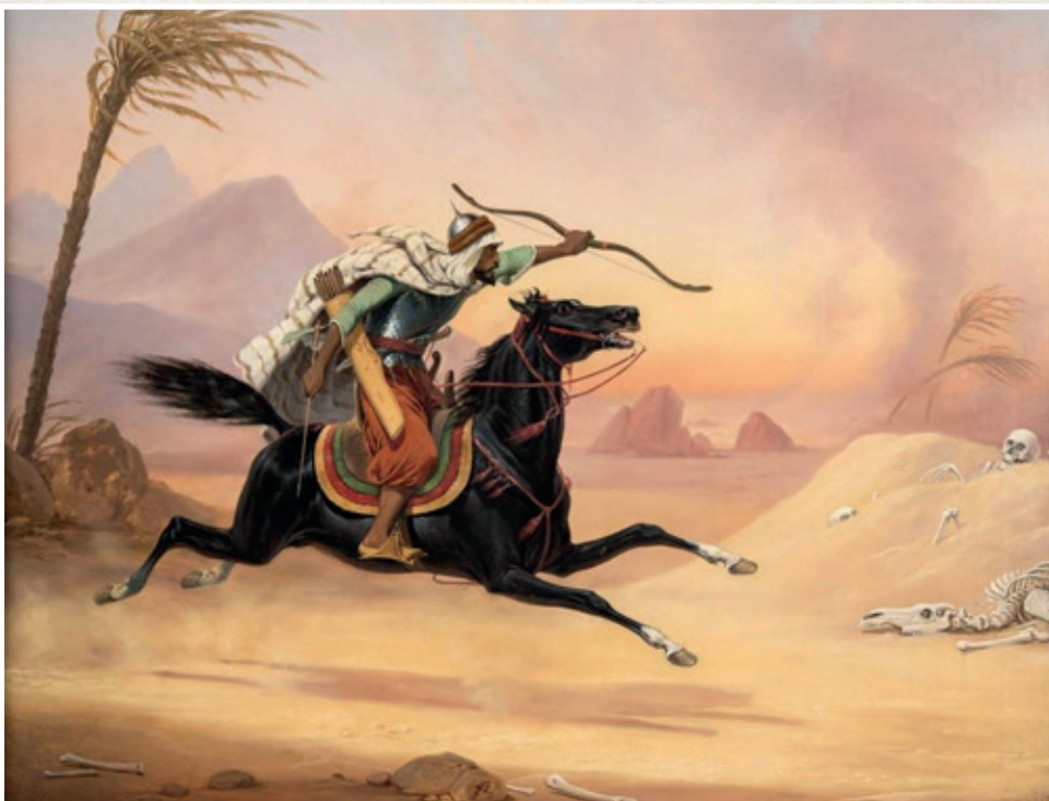
Faris, painted by January Suchodolski in 1836