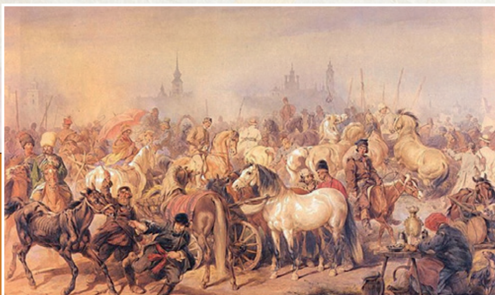
Horse market in Praga, painted by Juliusz Kossak in 1866