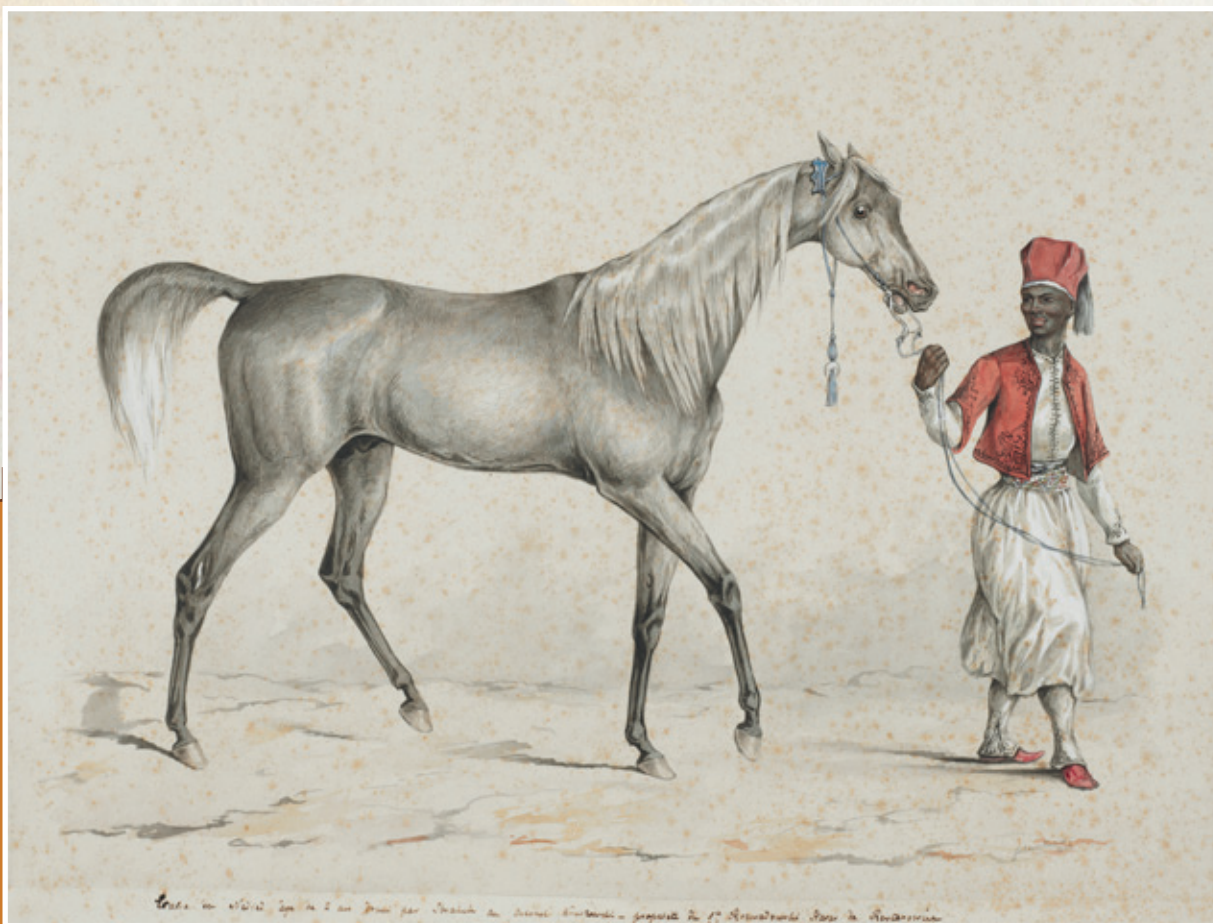
Arabian stallion with the beduin, painted in 1844 by Juliusz Kossak

Among the studs of the Borderlands, the effects of which have survived in the form of dam or sire lines, the stud of the Sanguszko princes, originating from Sławuta, definitely stood out. The stud in Sławuta adopted a distinctly Arabian direction around 1804, that is, from the time of the expedition of Kajetan Burski, the Sanguszko's equerry,